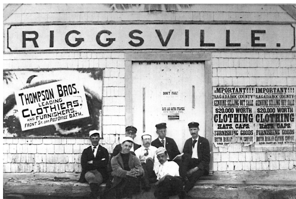
Steamship Crew at Riggsville Wharf

From 1870 to 1941, steamships were a part of daily life at Robinhood (formerly North Georgetown and later Riggsville). These fascinating and elegant vessels were the most efficient method of transporting people and goods along the coast and connecting the near shore islands to the mainland.