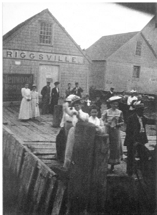
Waiting for the Steamship